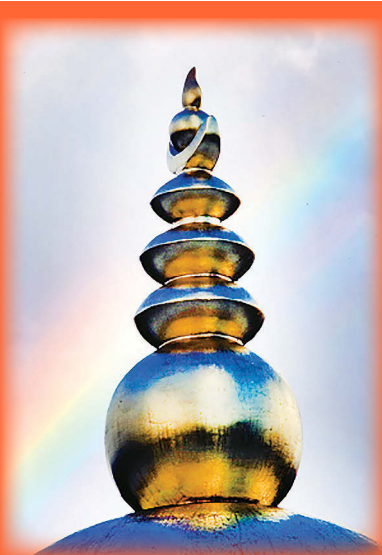
The "Brightness" Spire (with rainbow)

There is no bodily "thing" to be accomplished.